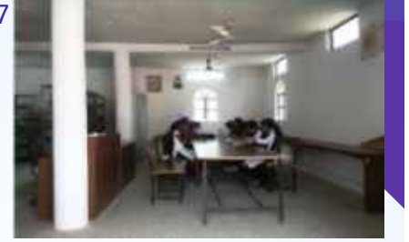
विद्यार्थी अध्ययन कक्ष