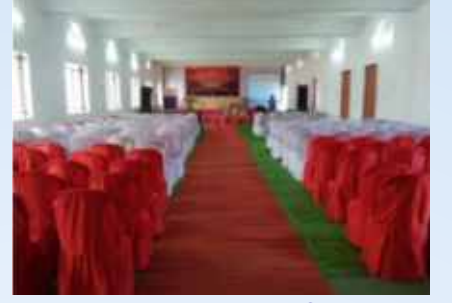
सुसज्ज सभागृह/वर्ग कक्ष