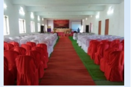
सुसज्ज सभागृह/वर्ग कक्ष