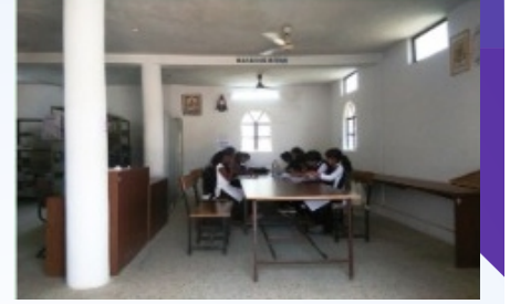
विद्यार्थी अध्ययन कक्ष