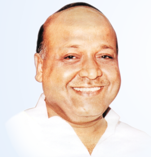
Hon'ble Shri Gopaldasji Agrawal Ex M.L.A. Gondia